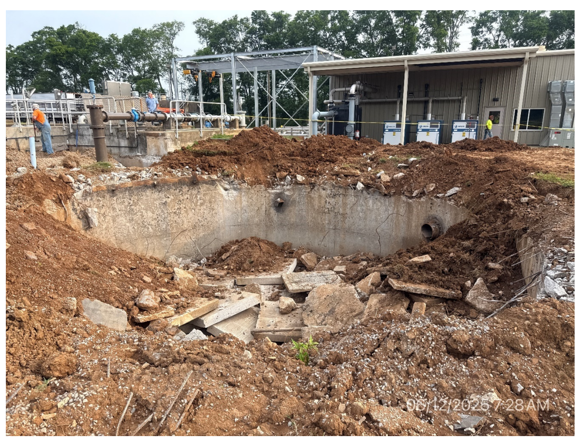
6. Demolition of Secondary Clarifier