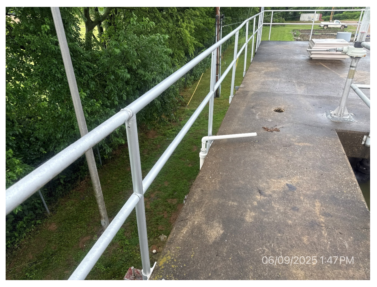
1. Repaired Handrail at Digester