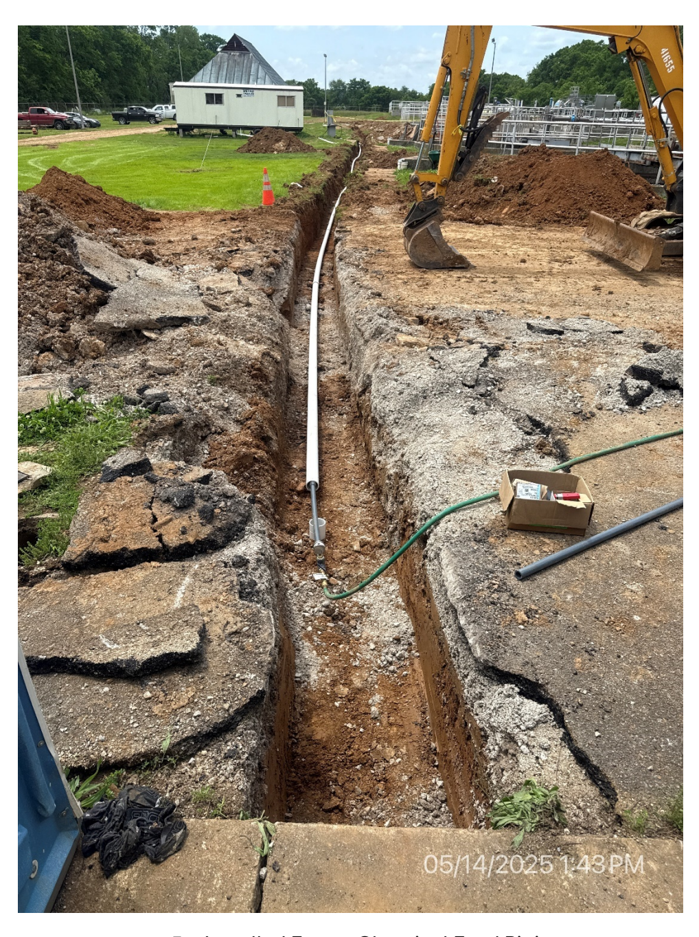
5. Installed Future Chemical Feed Piping