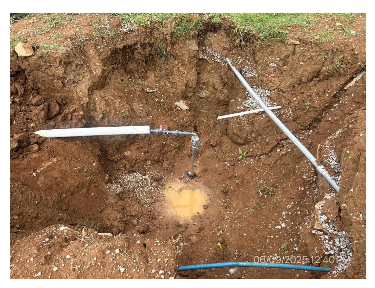
2. Installing Future Chemical Injection