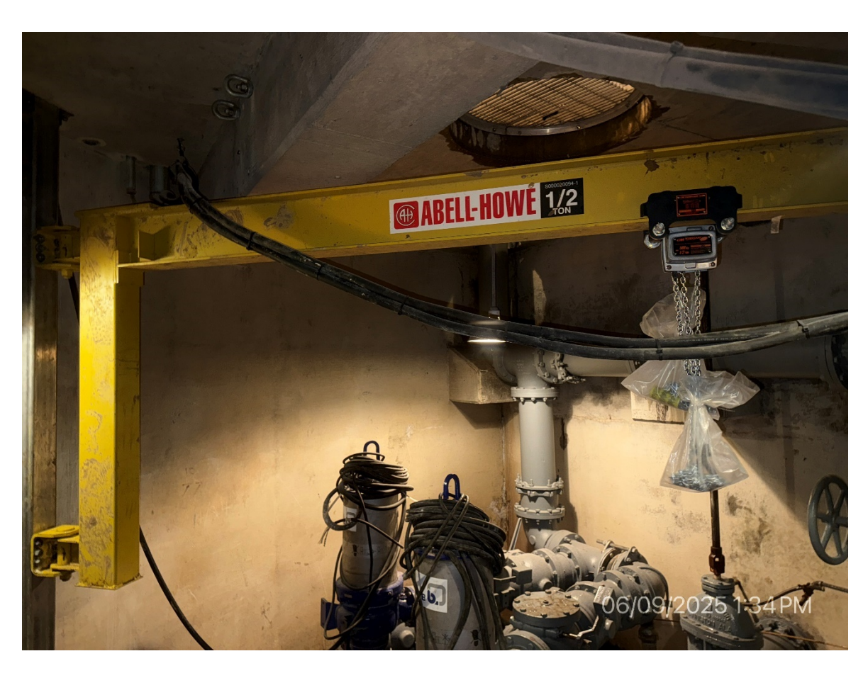
4. Installed Jib Crane at Influent Pump Station