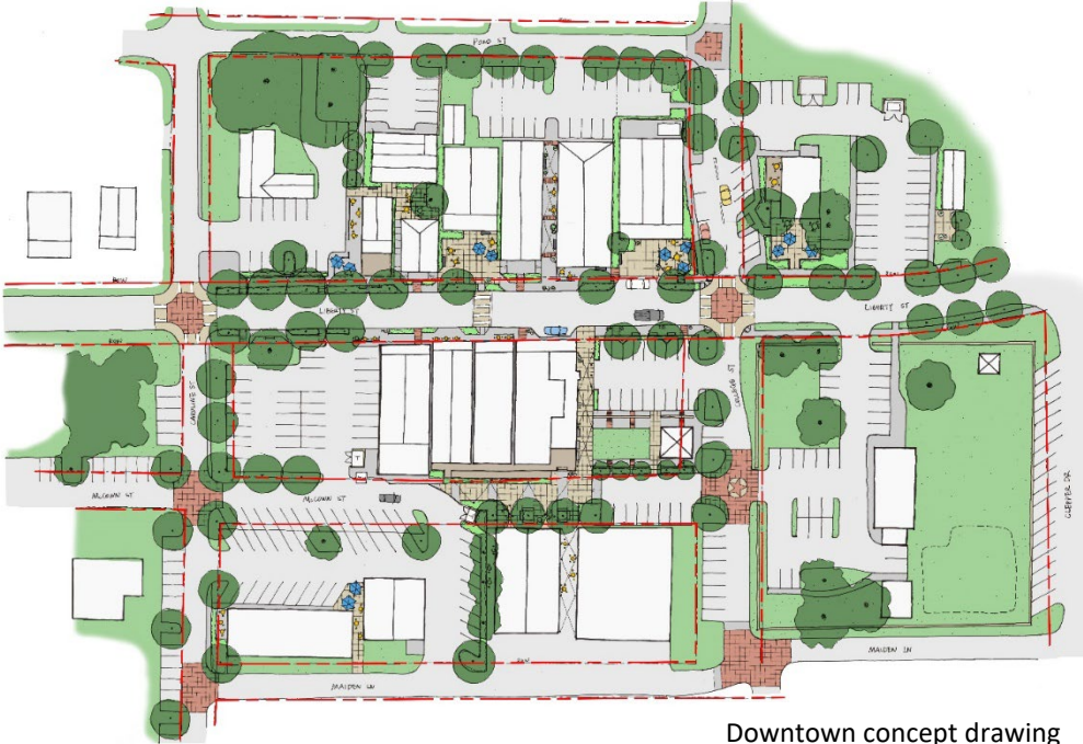
Downtown concept drawing