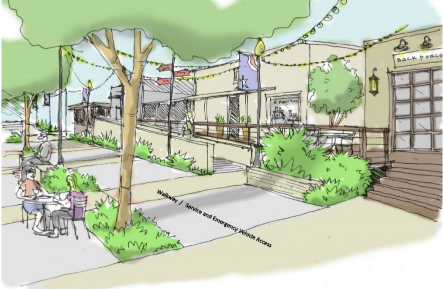
McCOWN STREET PEDESTRIAN IMPROVEMENTS

The next phase of the project will be the roadway and streetscape design for McCown Street. The MEDC issued a Request for Qualifications for the project on April, 13, 2022 and selected the Gunda Corporation to move forward on the design of the project in May 2022. The City is currently working on a drainage study for the downtown area and is also working on water and sewer upgrades that will be done before the above-ground improvements are constructed.