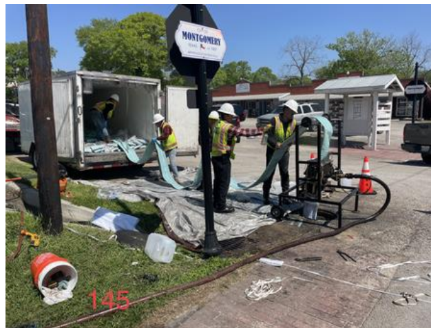
Figure 1: Installation of CIPP liner on March 15 th