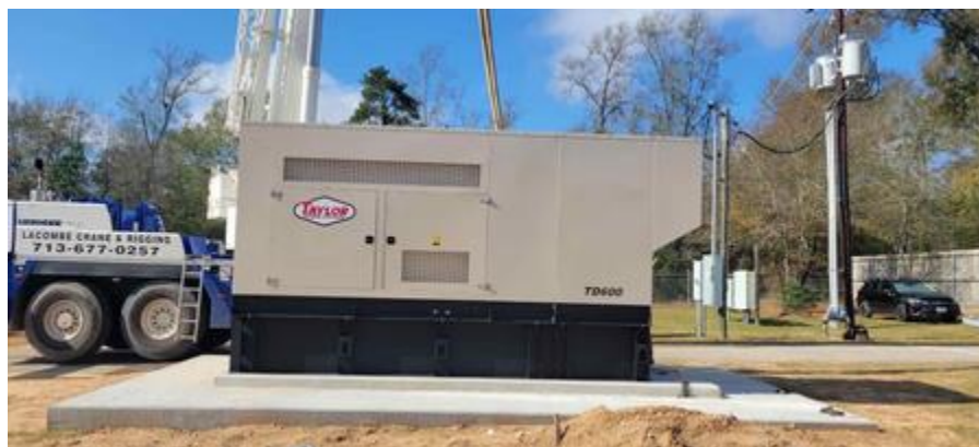
Figure 1: Newly Installed Generator January 11, 2023