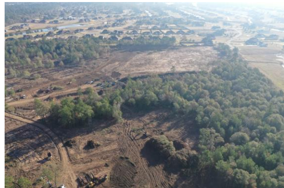
Figures 1 and 2: Clearing and Grubbing for Montgomery Bend December 28, 2022