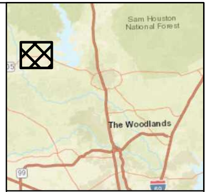
VICINITY MAP Scale: 1 inch equals 20 miles