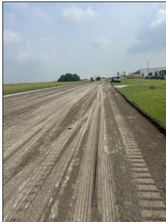
May 21, 2024 Existing Asphalt Removal