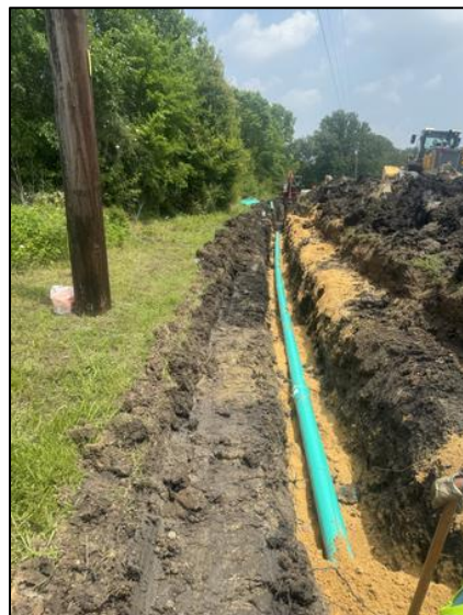
May 7, 2024 Sanitary Sewer Force Main Installation