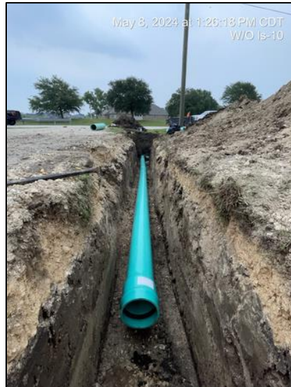
May 8, 2024 Sanitary Sewer Force Main Installation