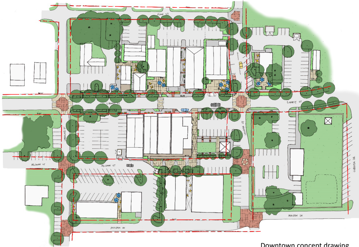
Downtown concept drawing

The next phase of the project will be the roadway and streetscape design for McCown Street. The MEDC issued a Request for Qualifications for the project on April, 13, 2022 and expects to select a firm and move forward on the design of the project in May 2022. The City is currently working on a drainage study for the downtown area and is also working on water and sewer upgrades that will be done before the above-ground improvements are constructed.