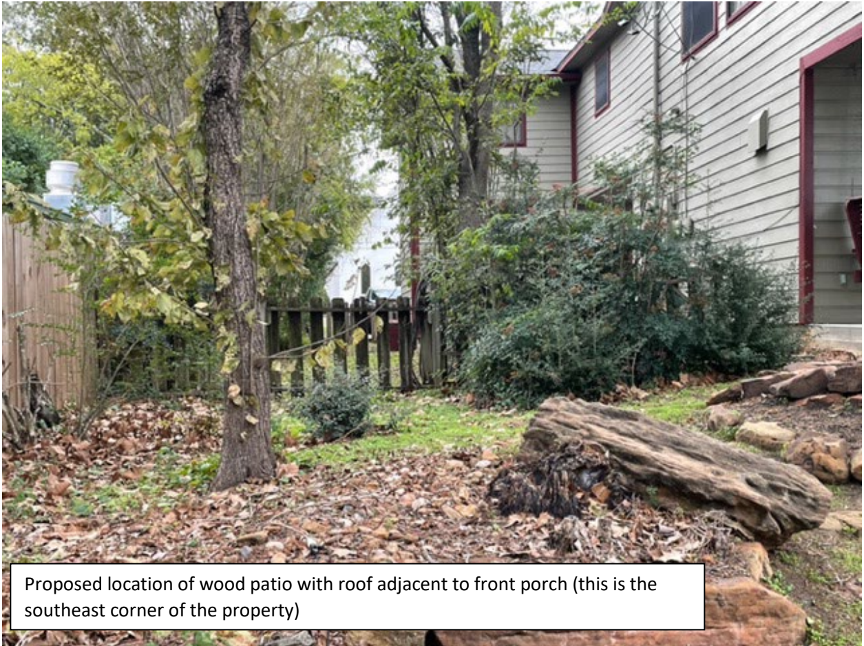
Proposed location of wood patio with roof adjacent to front porch (this is the southeast corner of the property)