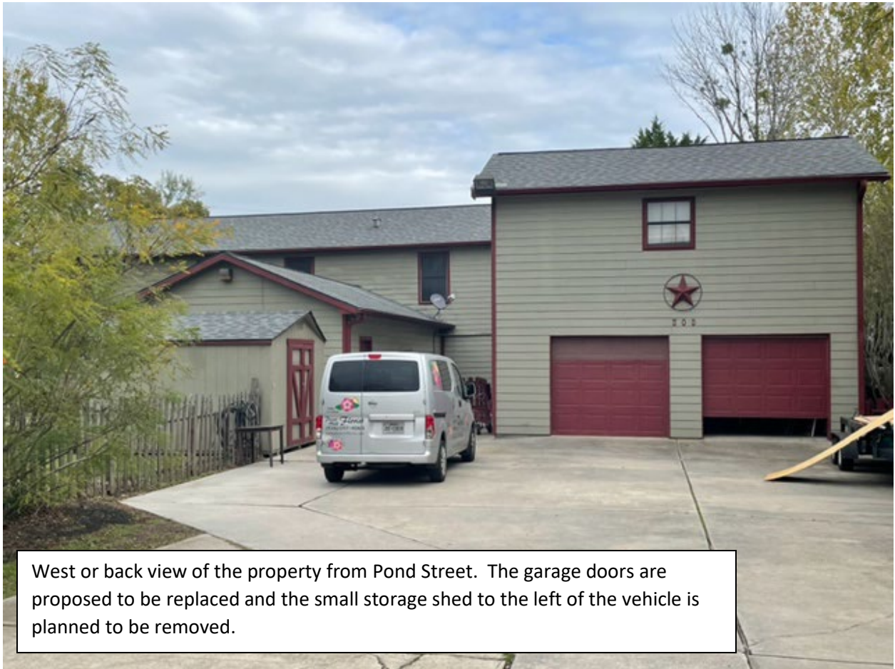
West or back view of the property from Pond Street. The garage doors are proposed to be replaced and the small storage shed to the left of the vehicle is planned to be removed.