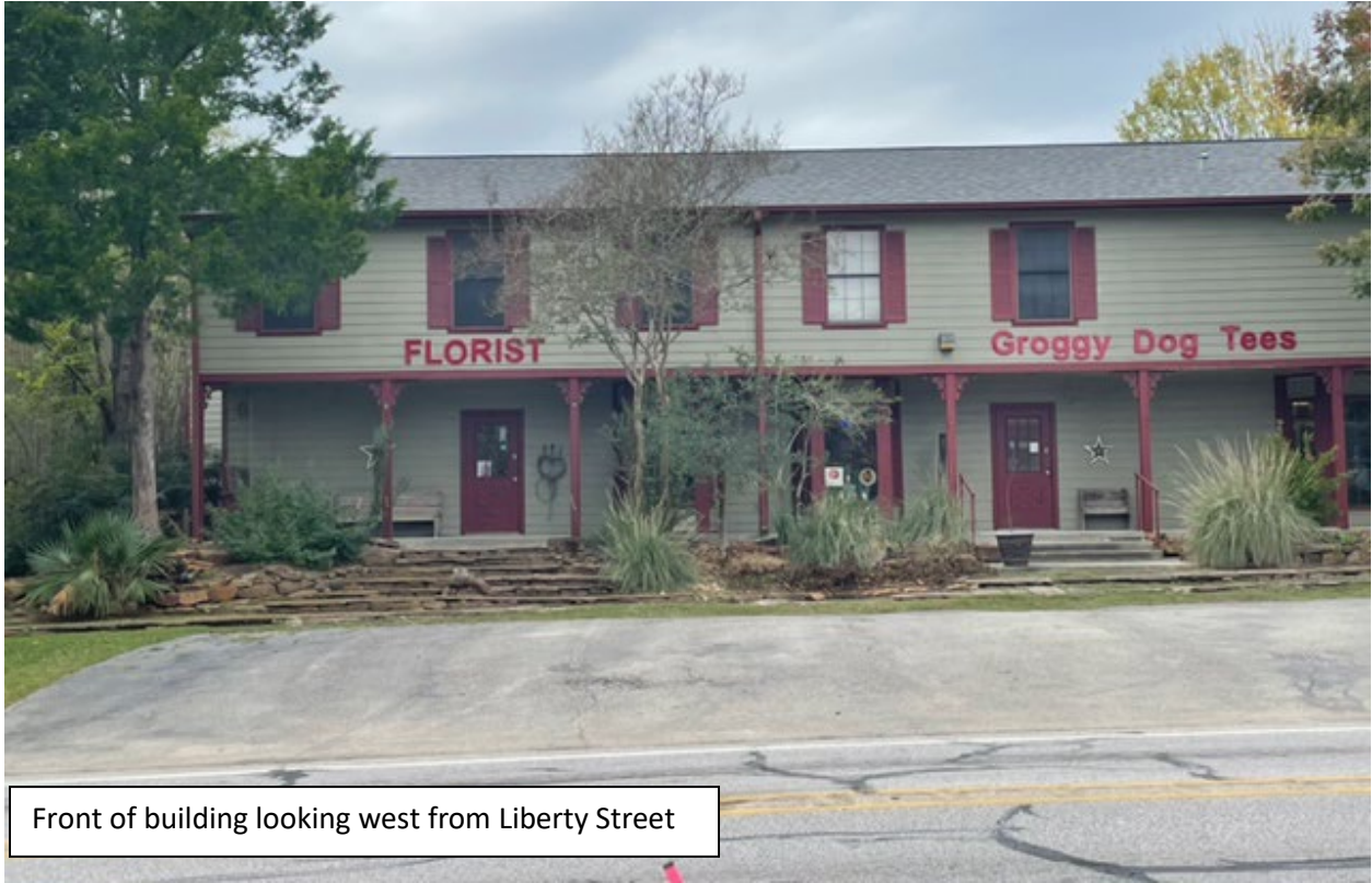
Front of building looking west from Liberty Street