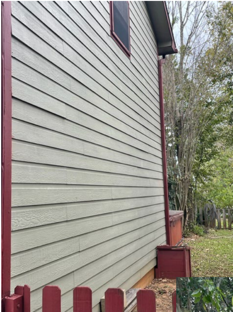
South wall of the detached garage with the hot tub from the previous photo visible. A new exterior staircase is proposed with a door to replace the window shown in the photo.