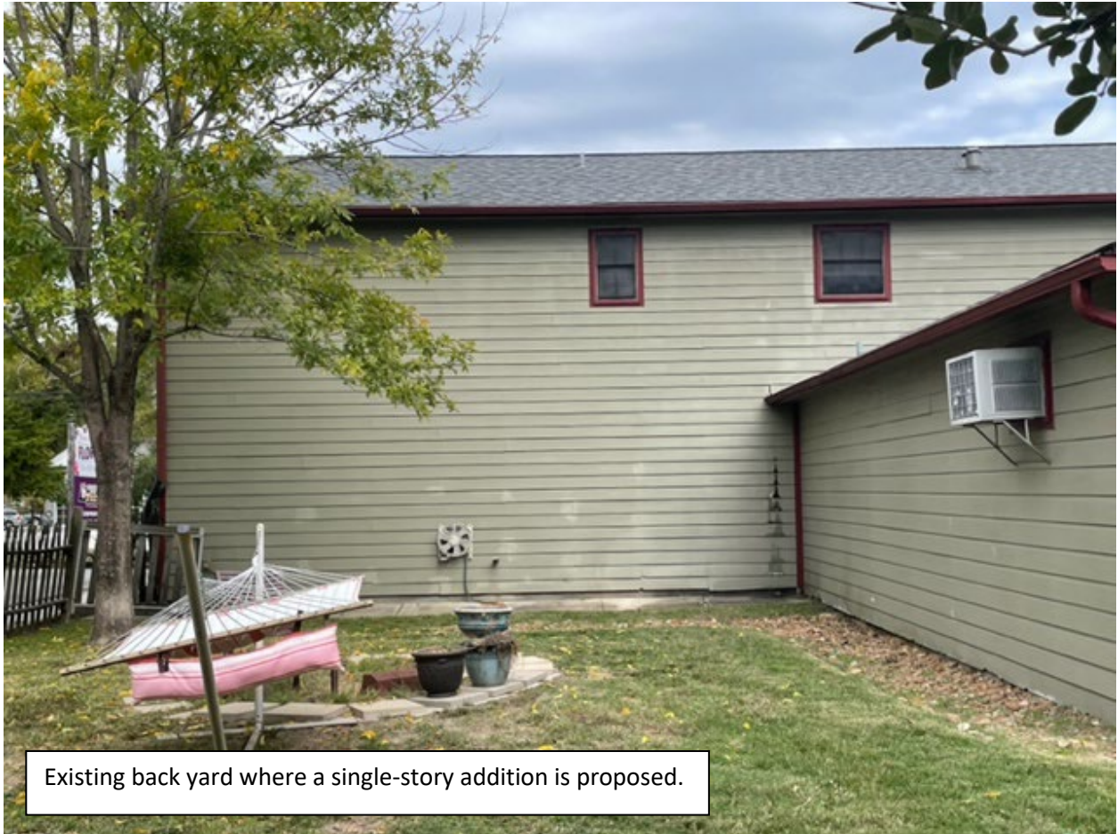
Existing back yard where a single-story addition is proposed.