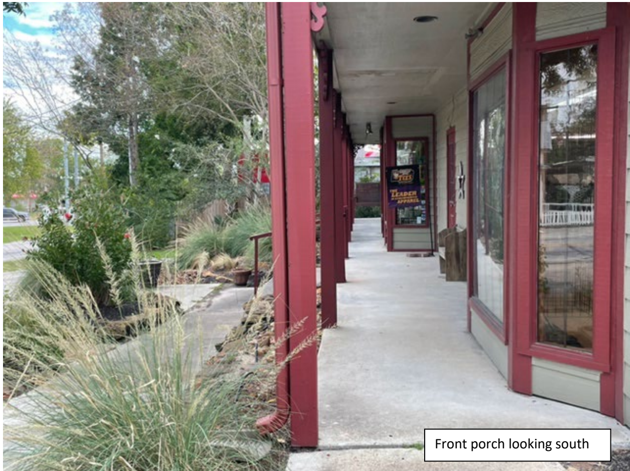
Front porch looking south