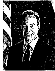
Joe Straus Former Texas House Speaker