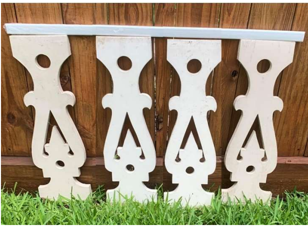
Proposed flat sawn balusters

We would like to add more character back into the home and solidify the Folk Victoria style by replacing the current porch balusters which are simpler in style to a flat sawn style. Flat sawn is from the Victorian area seen in many Fok Victorian & Eastlake Victorian style homes.