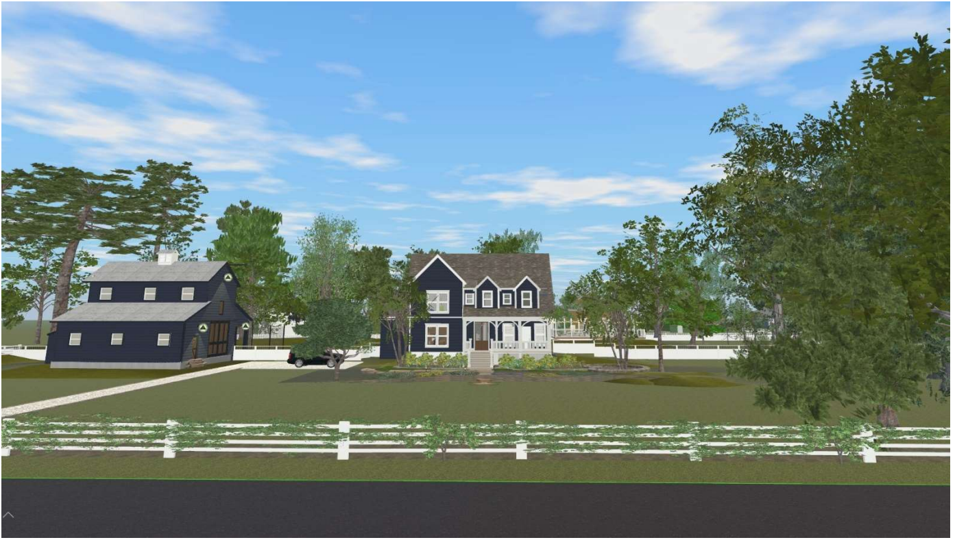
Final proposed elevation