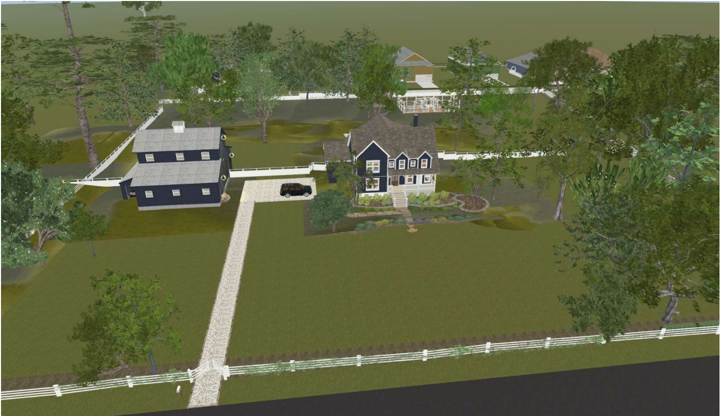
Aerial view of property for fencing