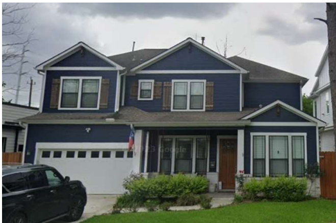
Sherwin Williams Naval Exterior