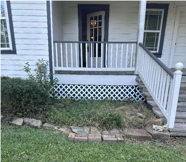
Current front door