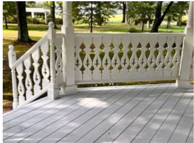
1890's Folk Victorian Porch Examples