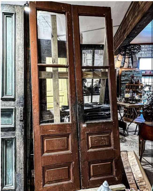
Proposed front doors

We'd also like to center the steps in front of the doors.