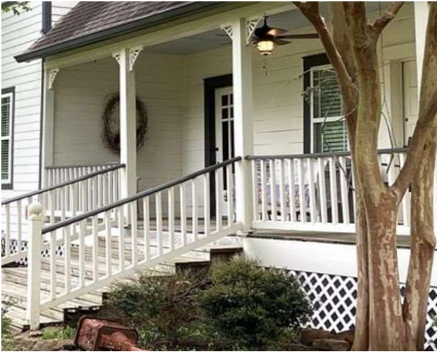
Current front porch