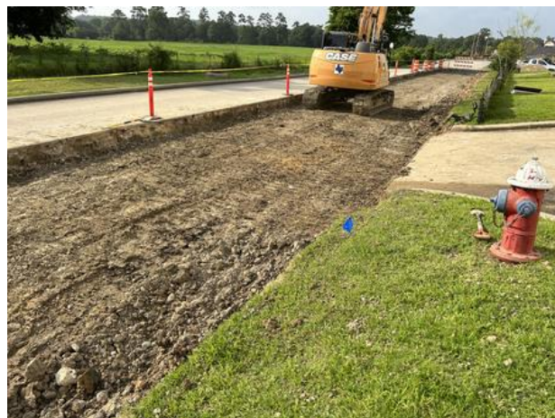
Pavement Backfilling on June 19, 2023