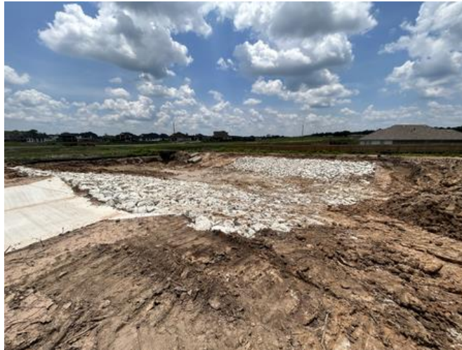
Figure 1: Rip-Rap at Pond outfall and ditch crossing June 7 th .