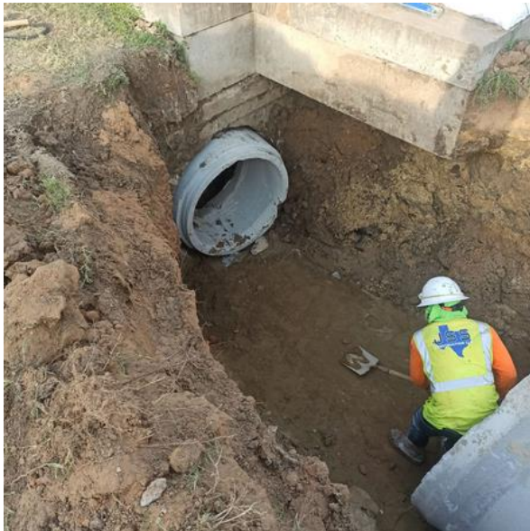
Storm Sewer Installation on June 19, 2023