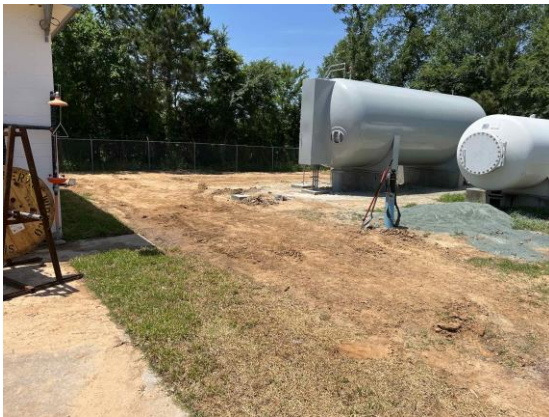
Figure 1: Hydropneumatic Tanks May 17, 2022