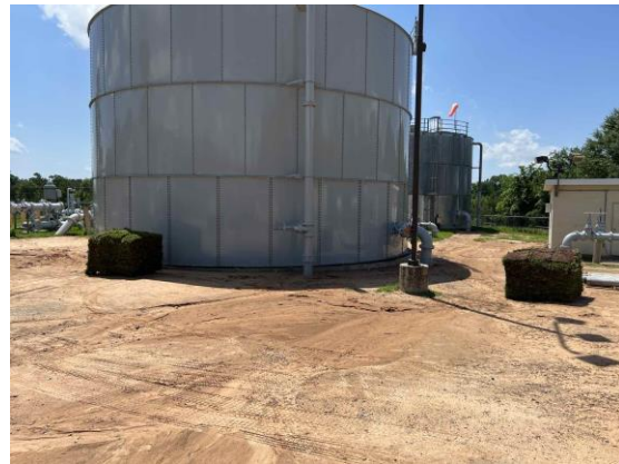
Figure 2: Ground Storage Tank May 2, 2022