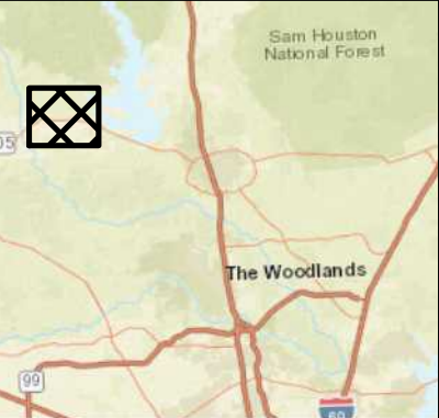
VICINITY MAP Scale: 1 inch equals 20 miles