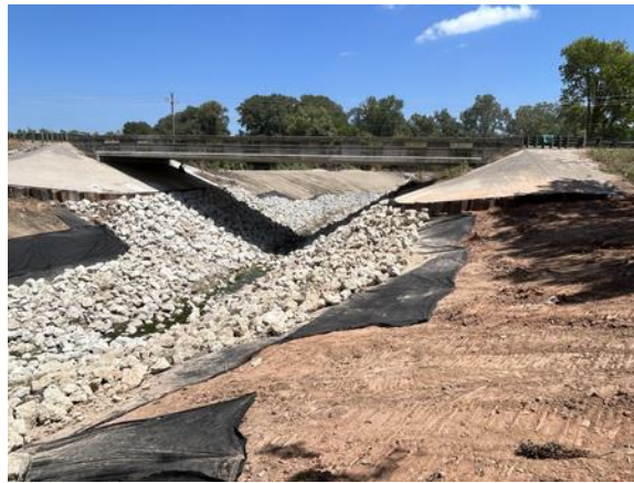
Lonestar Parkway Bridge construction August 10, 2023