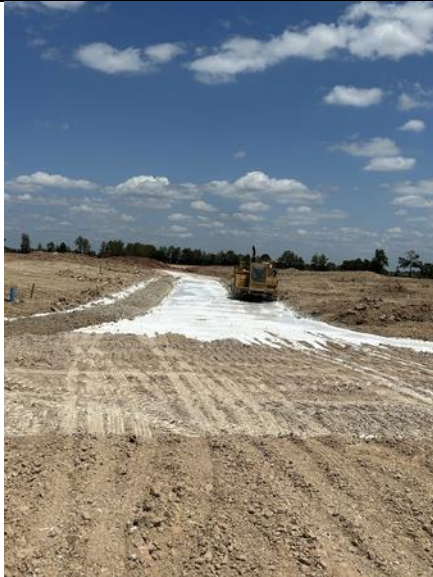
Lime Treatment for subgrade on August 8, 2023