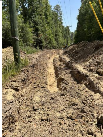
Waterline trench work along FM 1097 on July 17, 2023