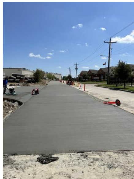
Poured Concrete Pavement on August 10, 2023