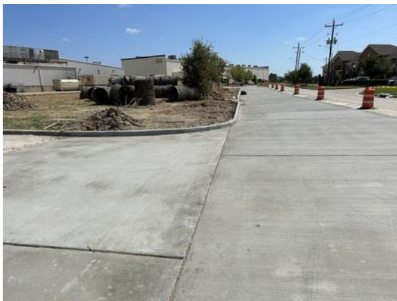
New Concrete Pavement on August 15, 2023