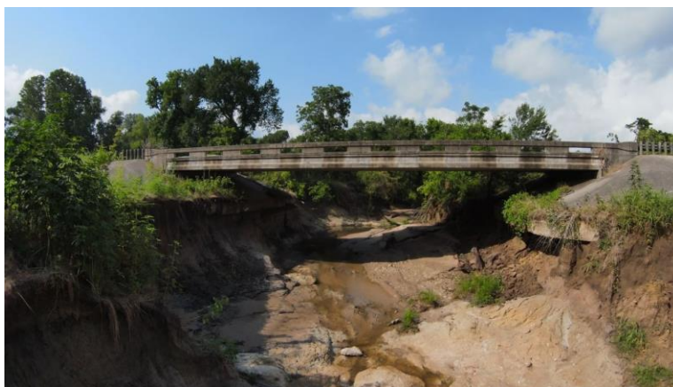
Lonestar Parkway Bridge prior to construction