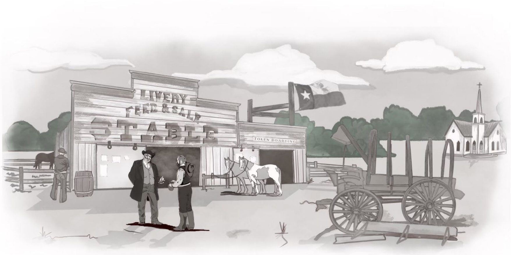
A conceptual rendering of the mural. The completed mural will be in black and white.