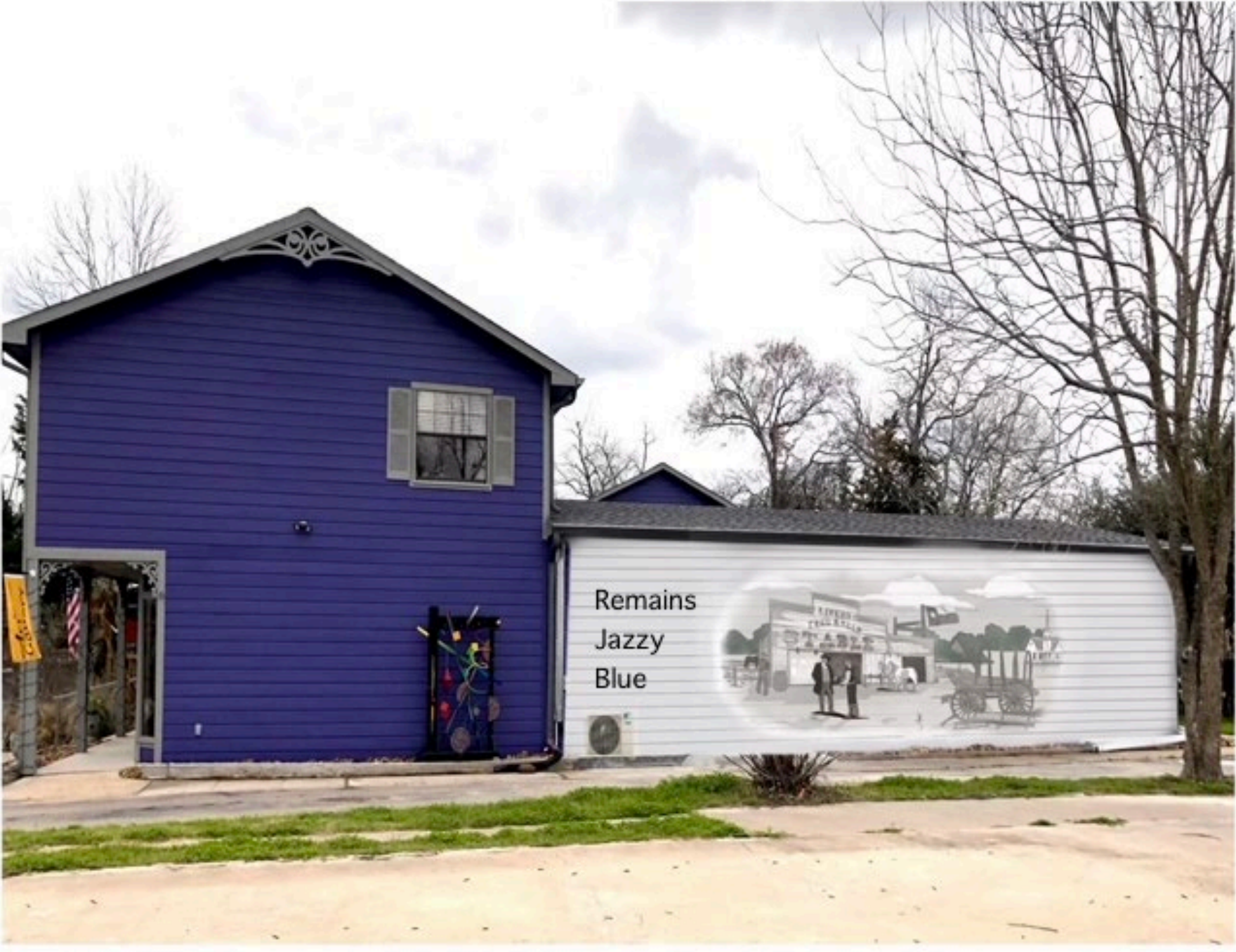
A mock up image of the proposed size and location of the mural on the north wall of the building. The wall will remain Jazzy Blue.