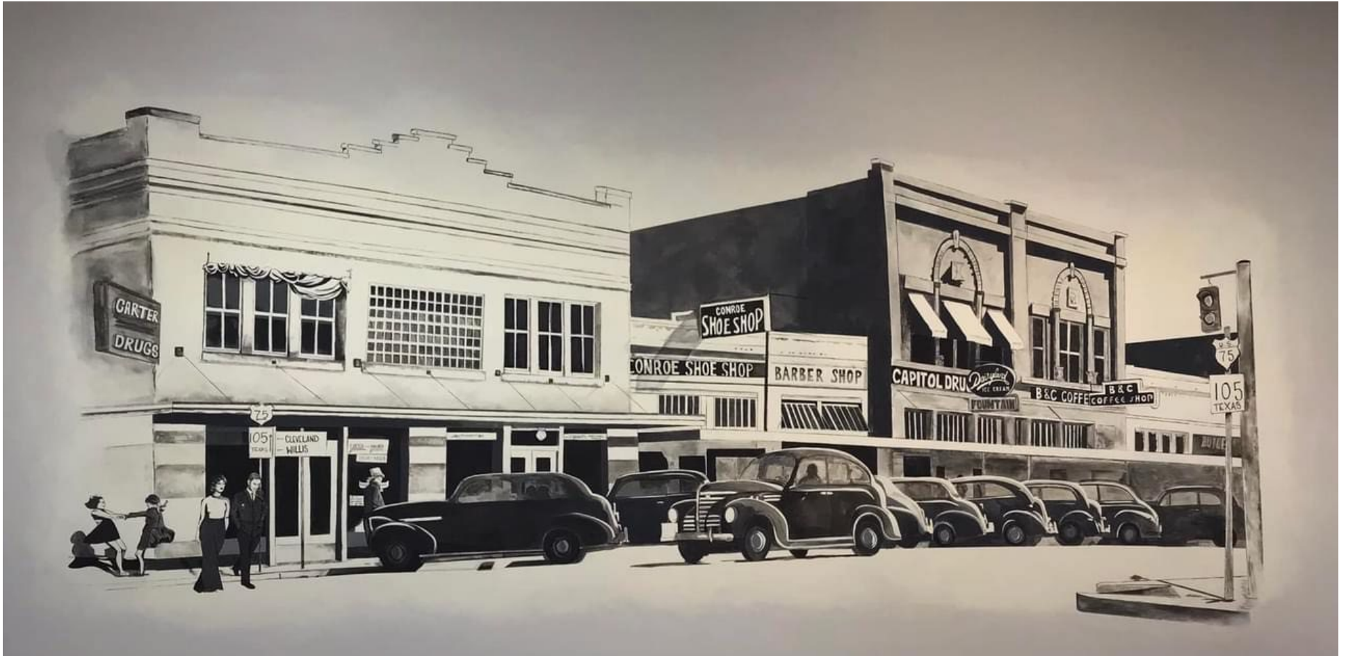
A photo of a completed indoor wall mural located in downtown Conroe, Texas by artist Amy McCain.