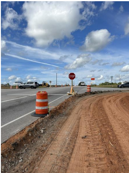
Subgrade Preparation (Northbound) September 21, 2023