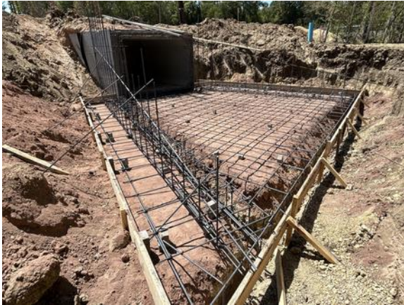
Storm Box Installation on September 8, 2023