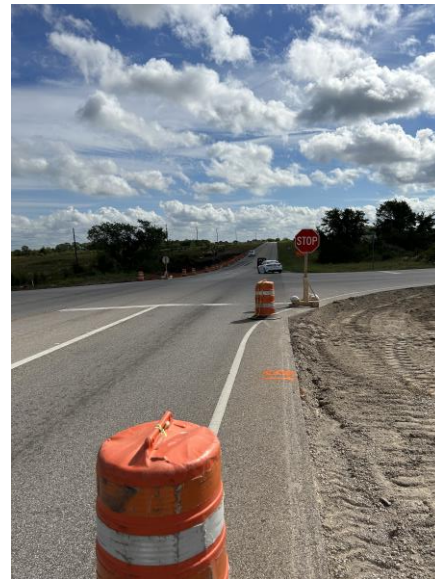
Subgrade Preparation (Eastbound) September 21, 2023