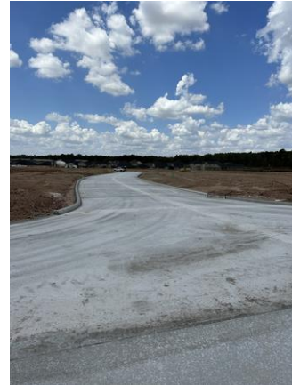
Finished roadway on September 5, 2023