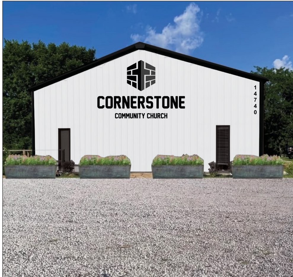
Proposed Scale is NTS