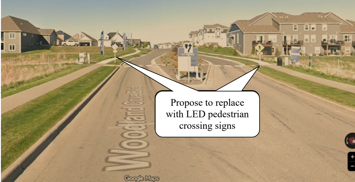
Figure 2. Regional Trail crossing at Woodland Cove Boulevard