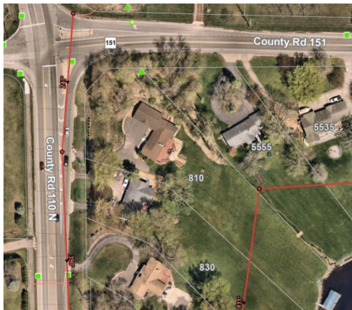
Figure 1. Storm sewer (green) and sanitary sewer (red) at CR 110 and CR 151

At the June 2, 2025 work session city council discussed miscellaneous drainage items in the city, including the erosion that extends southeast from the CR 110/151 intersection. As shown in Figure 1 there is a sanitary sewer manhole in the area that is susceptible to inflow and infiltration. To address the erosion issue, the vegetation in the drainageway would be removed and some rip rap placed to dissipate some of the energy from the runoff.