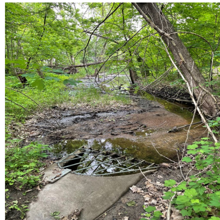
Figure 2. Storm sewer outlet at the southeast corner of CR 110 and CR 151