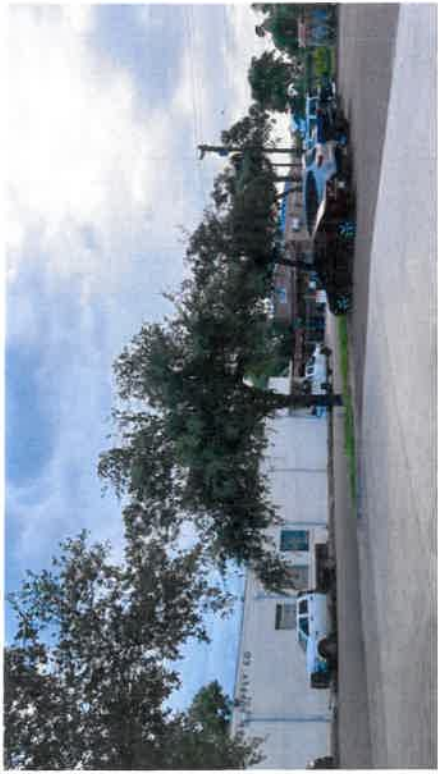
Barrera's Supply Co., Inc. 500 N. Conway in foreground 501 Doherty building on East side of alley EAST in the background

The curved top of the roof was developed by Mr. George Noser (Noser Construction) and used by many Valley warehouses to allow for internal space with NO SUPPORTS