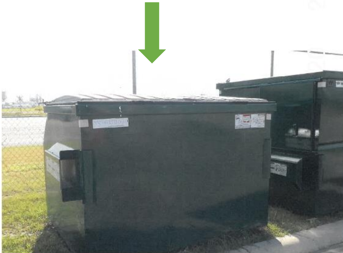
3 Cubic Yard Container