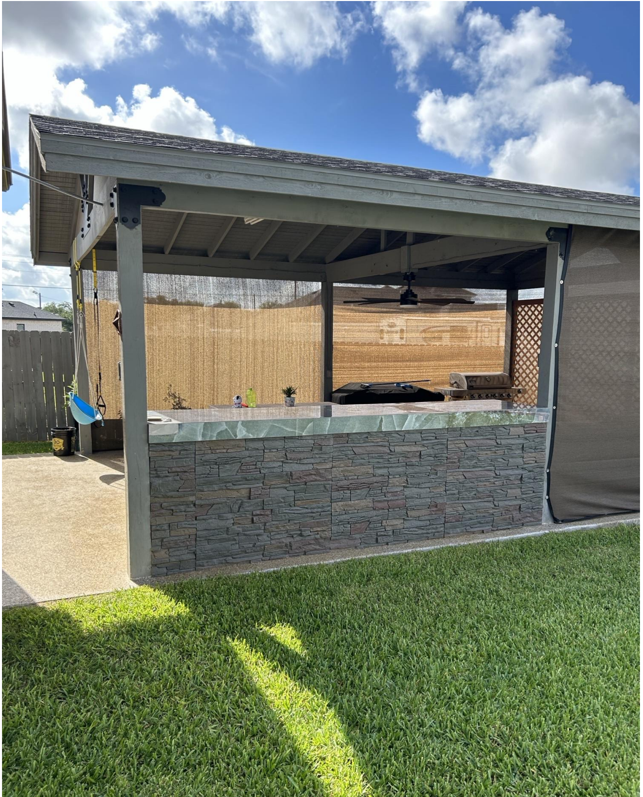
PATIO STRUCTURE PHOTO