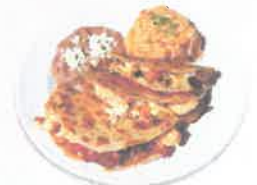
SHRIMP TACOS A LA PLANCHA