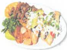
TACO LONCHE COMBO

CHICKEN TOSTADAS $8 2 tostadas topped with refried beans, cheese, baked and seasoned chicken, lettuce, tomato, cream, served with a side of rice. (Add avocado for $1.50)