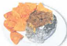
PAPA ASADA W/ BISTEK