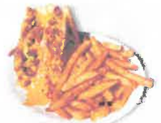
GRILLED CHEESE MAMALON

LONCHES $10 Order of 4 Lonches topped with mayo, bistek, cabbage, tomato, cilantro, crema, avocado, queso fresco. *Vegan option available for $12