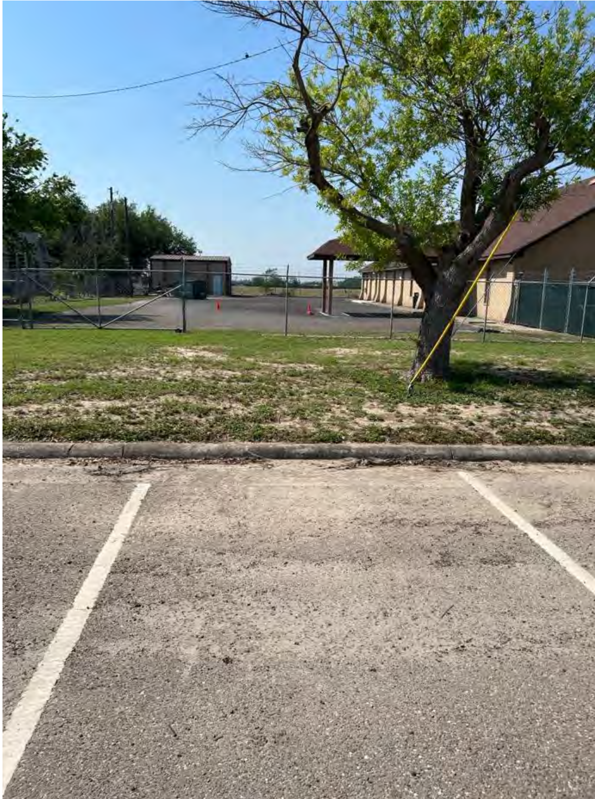
PHOTO OF PROPERTY