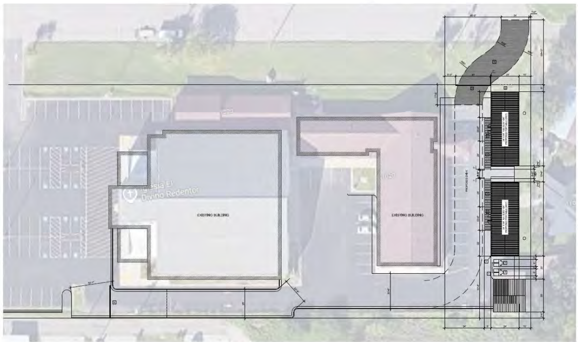
01 PORTABLES SITE PLAN