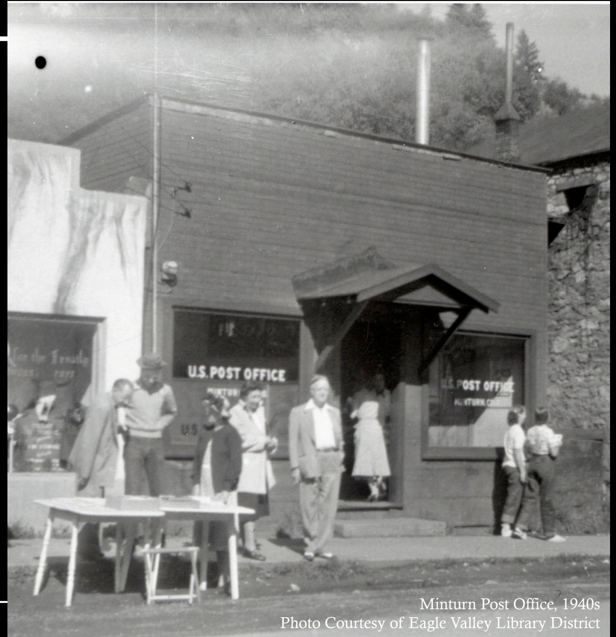
Minturn Post Office, 1940s

Create a process whereby property owners can determine if their structure would be historically designated without necessarily “supporting” such a designation.