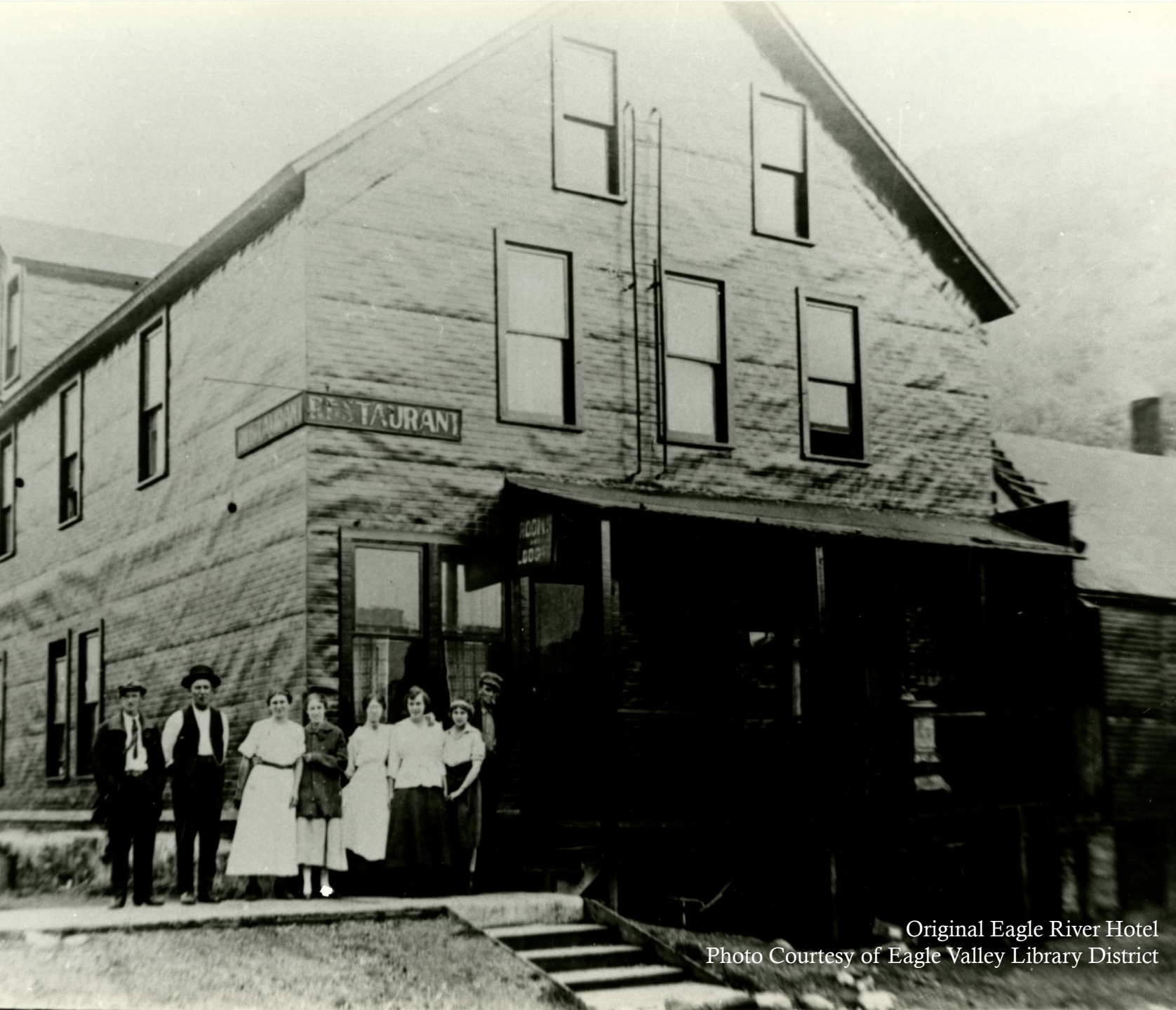
Original Eagle River Hotel