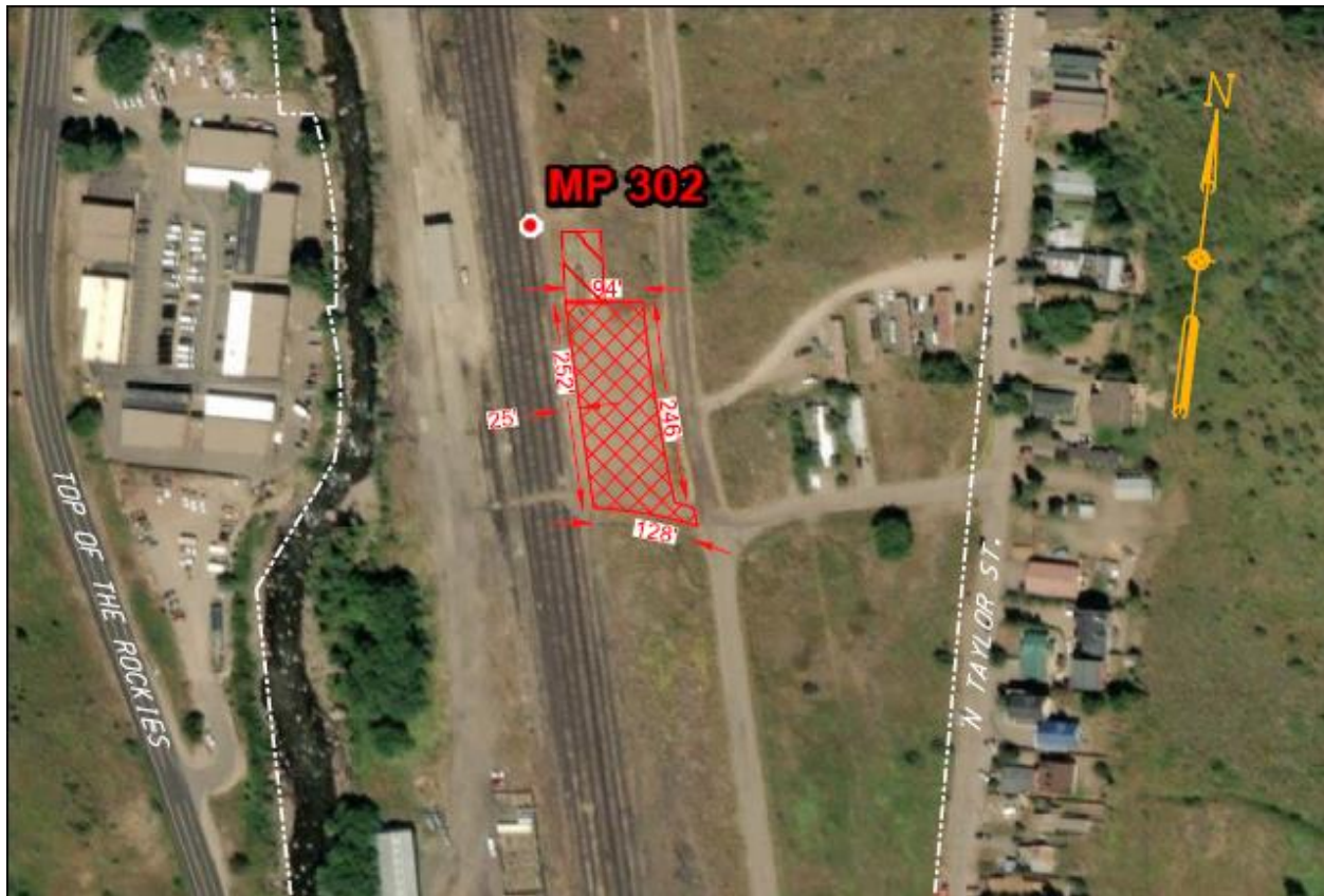
Figure 2: Lease Area Boundary

From the application, the following description is provided by the Applicant: