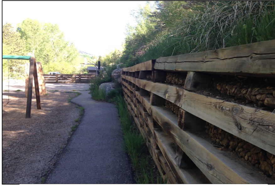
Failing Retaining Wall