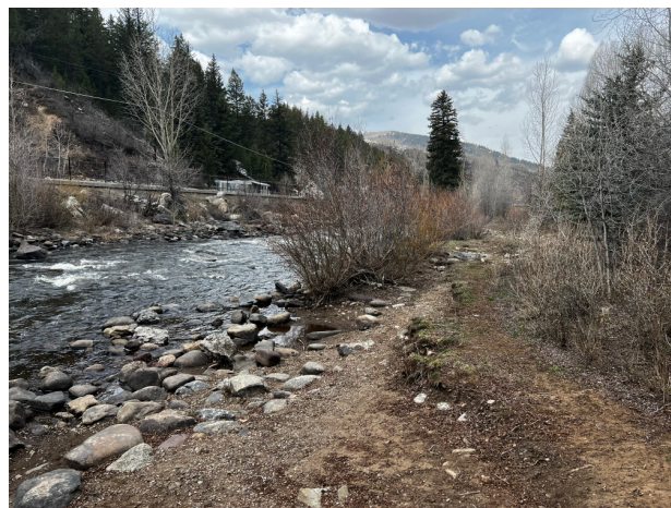
Potential River Access with Trails