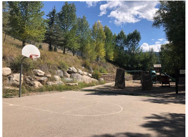
Existing Multi-Use Court