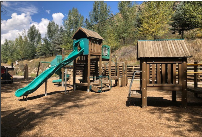
Non-Code Compliant Playground Structure