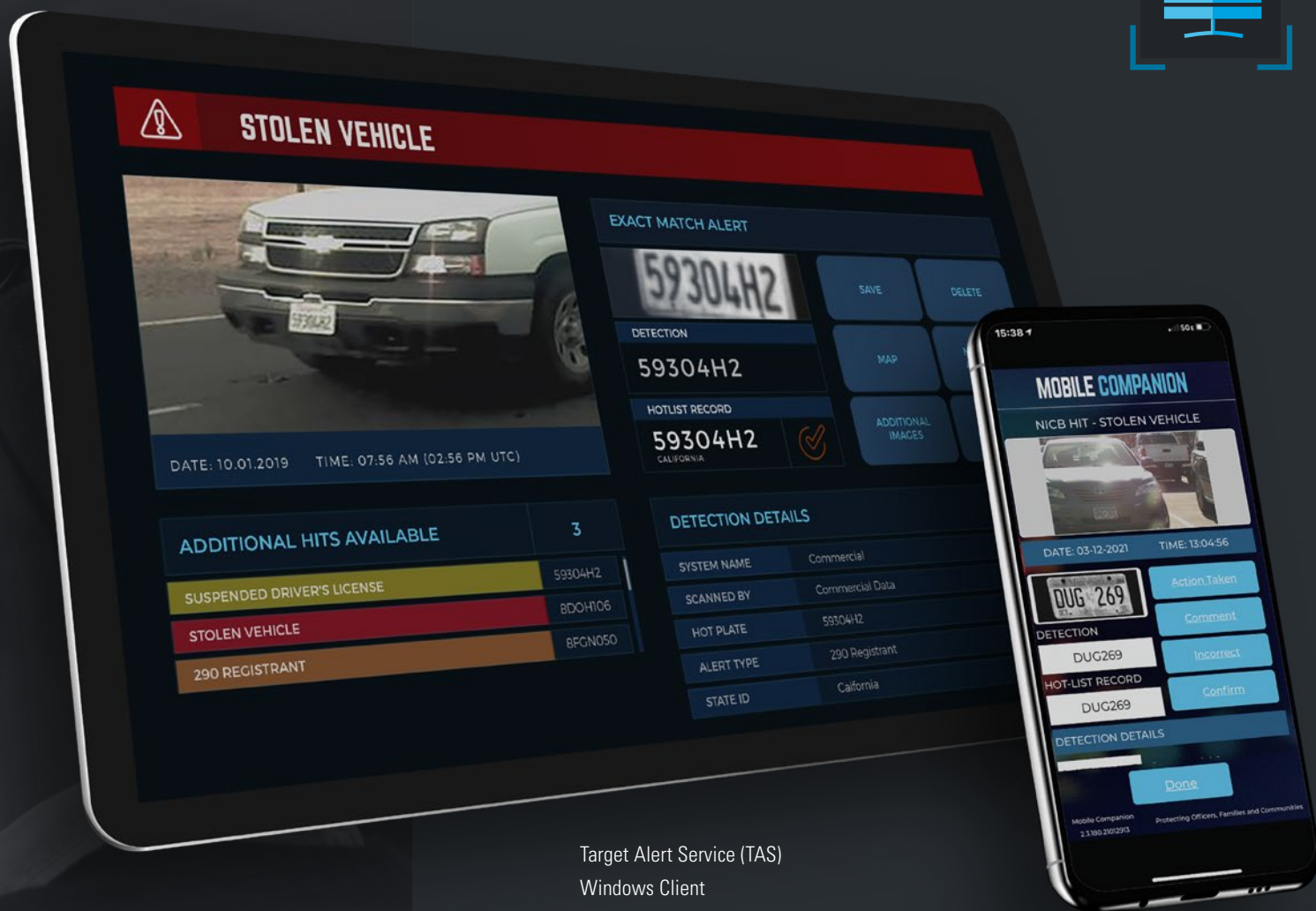
Target Alert Service (TAS) Windows Client