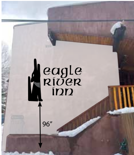
96" from bottom of graphic to grade

description: flat cut metal letters stud mounted