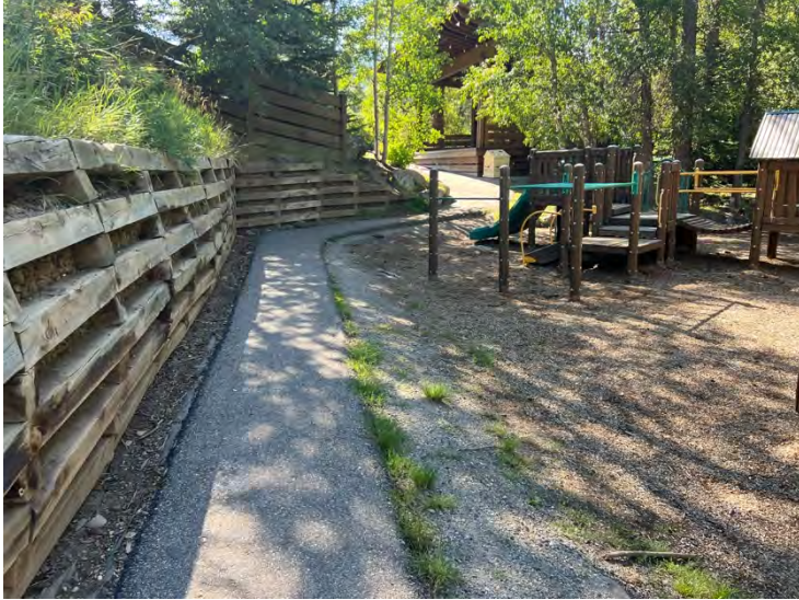
Failing Retaining Wall, Playground, and Interior Driveway