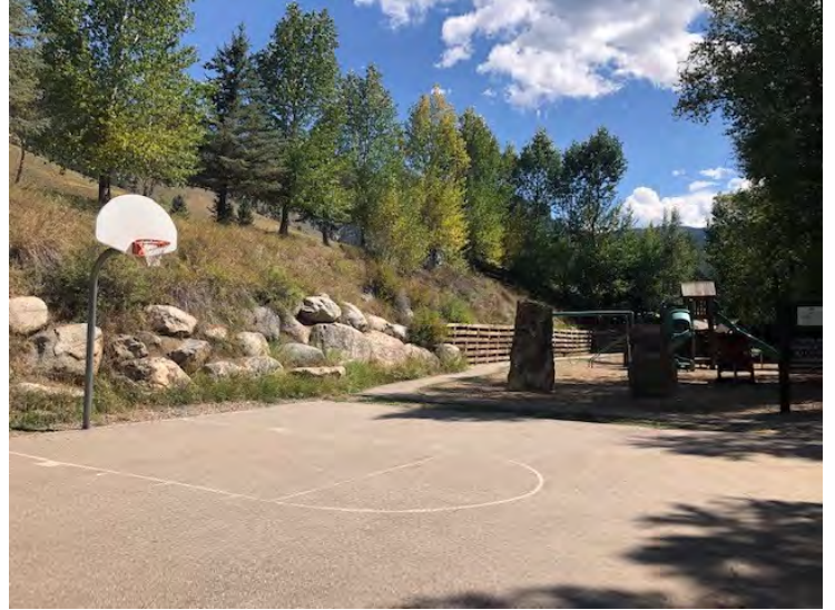
Existing Multi-Use Court