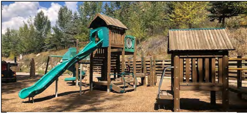
Non-Code Compliant Playground Structure