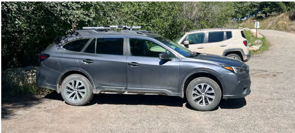
Small Parking Lot – Future ADA Access