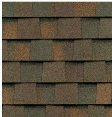
Solaris Max Def Heather Blend CRRC Product ID 0668-0123