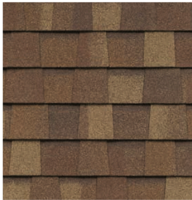
Solaris Max Def Resawn Shake CRRC Product ID 0668-0124