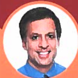
INTERNAL MEDICINE PHYSICIAN