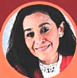
NUTRITIONIST FITNESS COACH