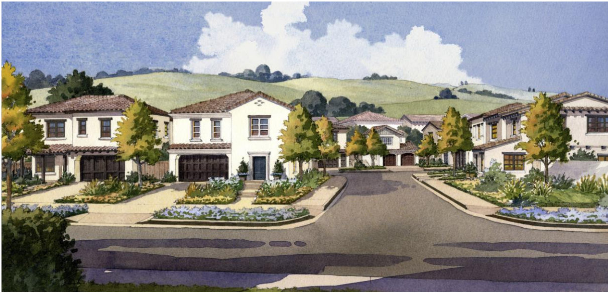
Streetscape - Eastern View from Rankin Drive

The architecture of the homes includes a mixture of Spanish and Craftsman-styles featuring concrete tile roofs and facades in varying earth tone colors. The facades consist of varying combinations of stucco, board and battens, brick veneer and hardie siding. Some homes feature small second level balconies. The applicant offers further diversity in window and door types and materials, exterior light fixtures, window awnings and other architectural elements.