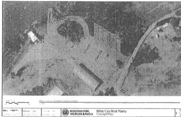
EXHIBIT A: MAP OF PROPOSED F.A.S.