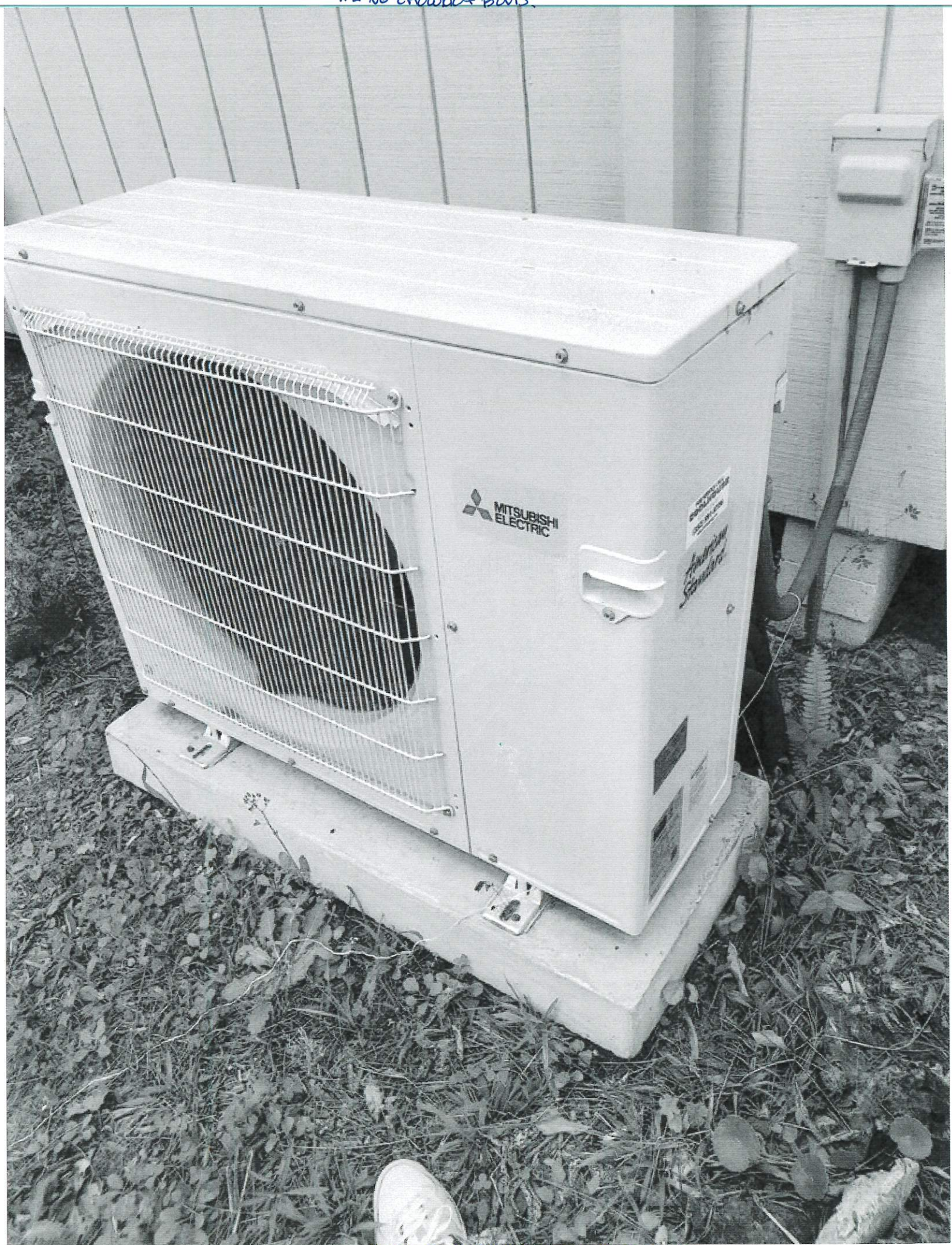
Photo of compressor w/ controls, etc