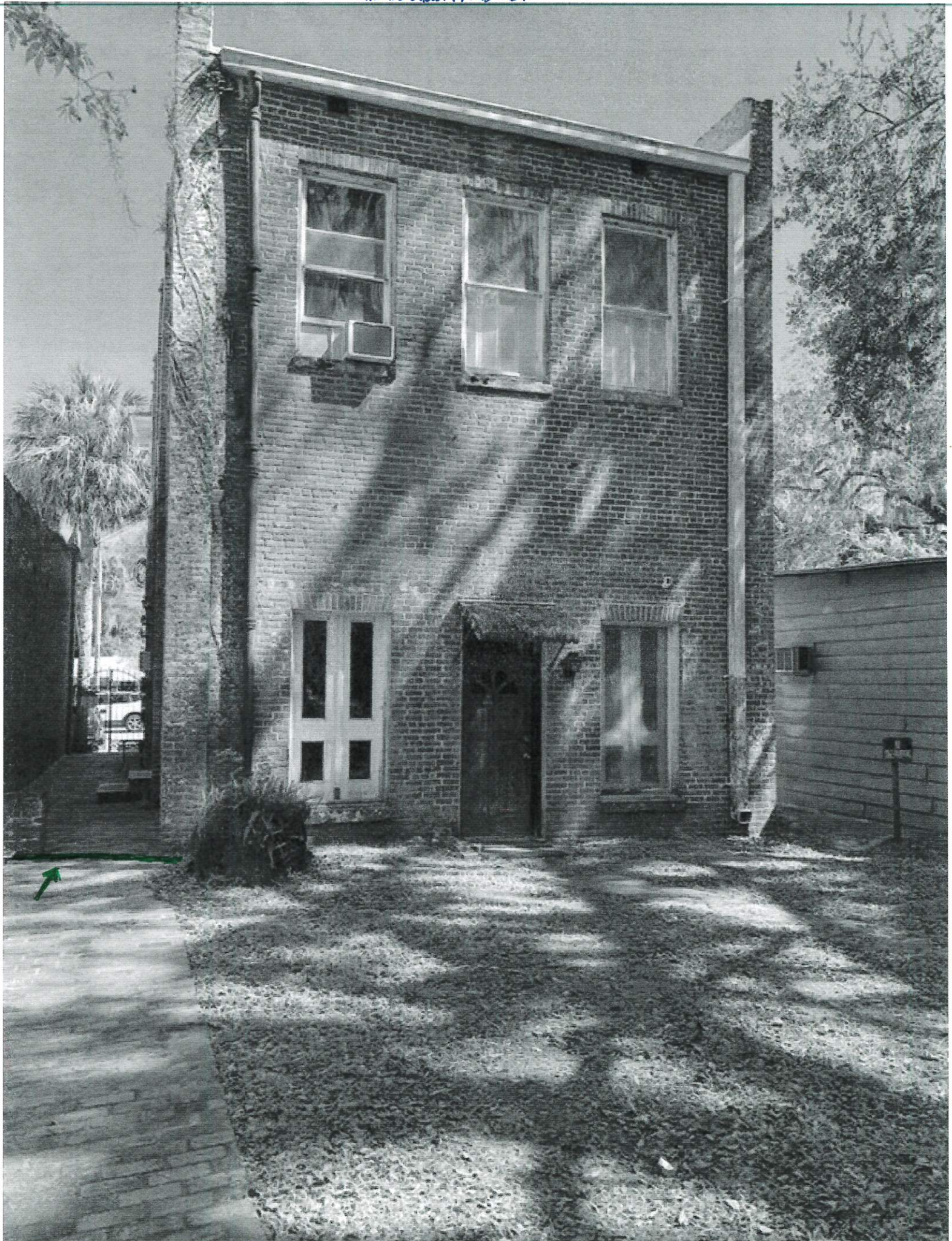
rear elevation showing NORTH ALLEY and PROPOSED LOCATION OF NEW GATE