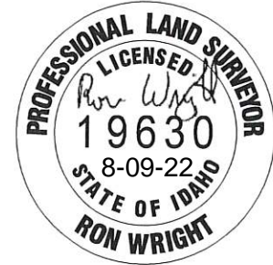
EXHIBIT A OLSON AND BUSH SUBDIVISION NO.2 WATER SERVICE EASEMENT NO.1

Date: October 13, 2021 Project: ID-LD-3868-21 Page: 1 of 1