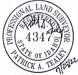
EXHIBIT "B" CITY OF MERIDIAN SEWER MAIN EASEMENT No. 2 FOR BELVEDERE LC A PORTION OF THE SW 1/4 SE 1/4 SECTION 16, T.3N., R.1W., B.M., ADA COUNTY, IDAHO