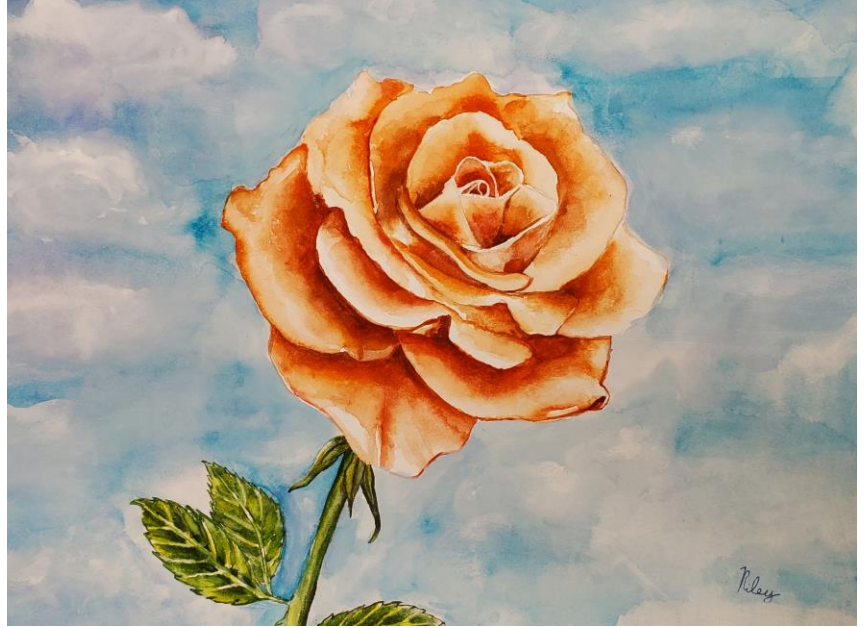
EXHIBIT A RILEY WILES