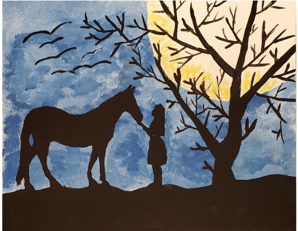
EXHIBIT A LEANA TACKETT