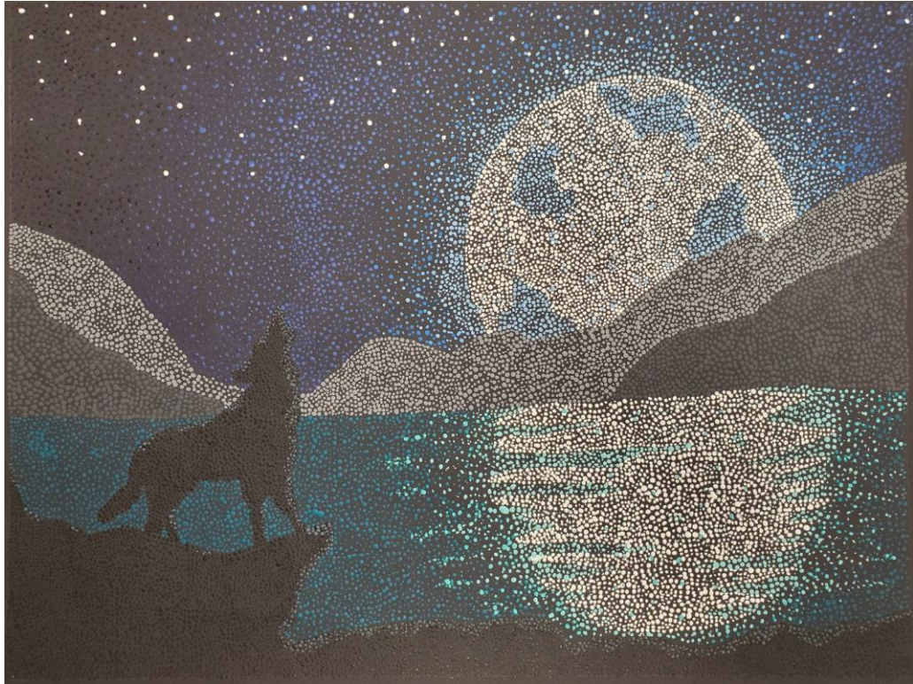
EXHIBIT A KAMDEN PROCK