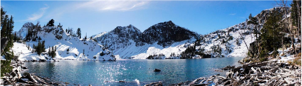
EXHIBIT C SAWTOOTH LAKE