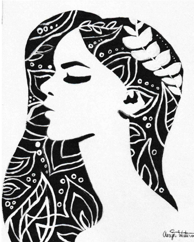
EXHIBIT A AERYN WATERMAN