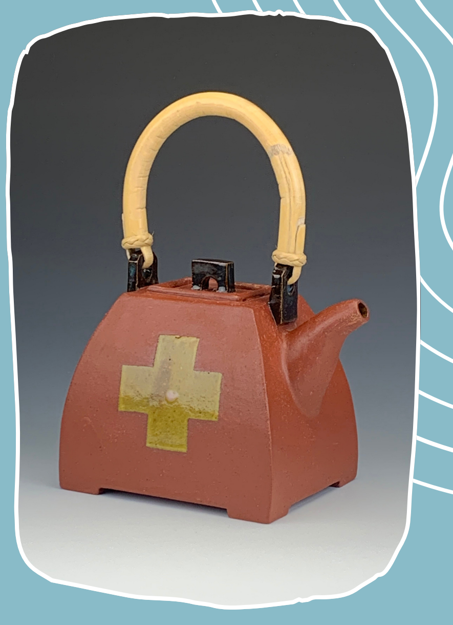
EXHIBIT ON DISPLAY: AUGUST 6 - SEPETEMBER 27

ARTIST TALK: SEPTEMBER 10 FROM 12PM - 1PM