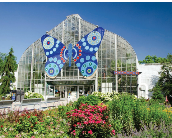
Krohn Conservatory at Eden Park

Home to the Cincinnati Art Museum and the Krohn Conservatory, Eden Park is one of the most popular of the Cincinnati Parks.