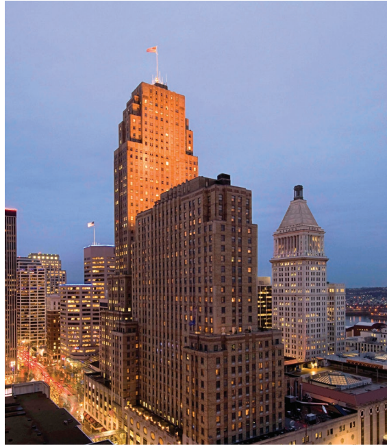
Hilton Cincinnati Netherland Plaza