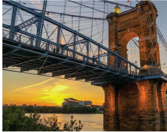
Catch the sunset at Smale Riverfront Park by the Roebling Suspension Bridge