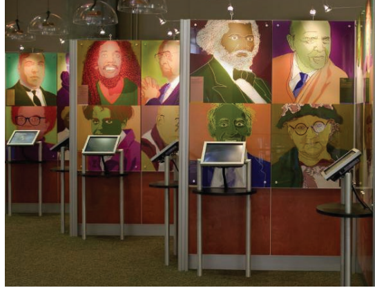
National Underground Railroad Freedom Center