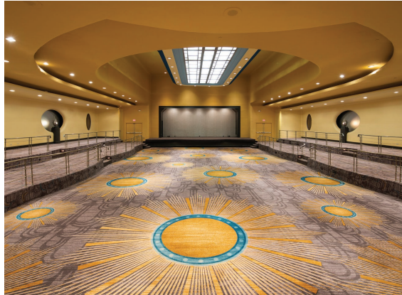
Caprice Pavilion inside the historic Hilton Cincinnati Netherland Plaza