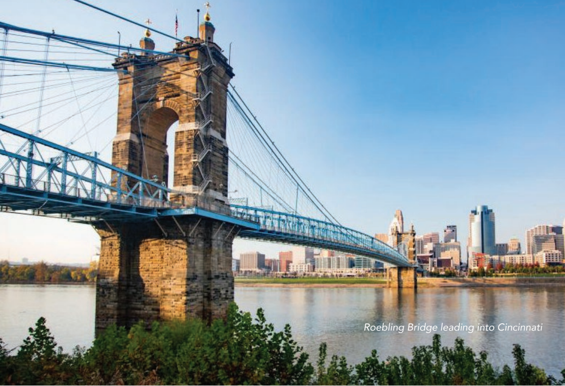
Roebling Bridge leading into Cincinnati