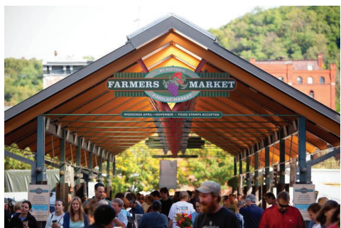
Farmers Market at Findlay Market

The National Underground Railroad Freedom Center stands as a monument to freedom bringing to life the importance – and relevance – of struggles for freedom around the world, throughout history and today.