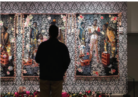
21c Museum Hotel

The contemporary art museum, cultural civic center and hotel is located in the 100-year-old renovated Metropole building, which was recently listed on the National Register of Historic Places. It is adjacent to the Contemporary Arts Center and across the street from the Aronoff Center for the Arts. It is open to the public free of charge, 24 hours a day, seven days a week.