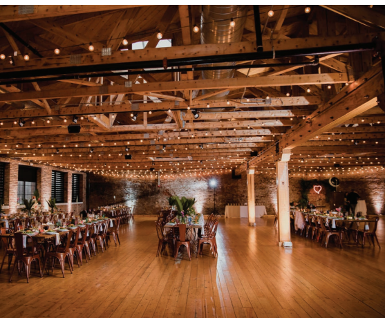
Rhinegeist Brewery Clubhouse