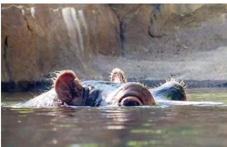
Famous Fiona, the hippo at the Cincinnati Zoo

Visit the world-famous hippo, Fiona, at the second-oldest zoo in the nation and the National Historic Landmark that is consistently ranked as one of the top zoos in the country.