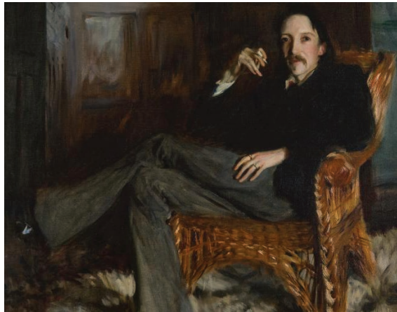
John Singer Sargent at the Taft Museum of Art