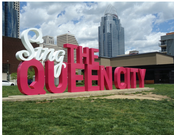
"Sing the Queen City" sculpture in Freedom Park

The City of Cincinnati is served by the Cincinnati/Northern Kentucky International Airport. There are a number of transportation options to and from the airport.