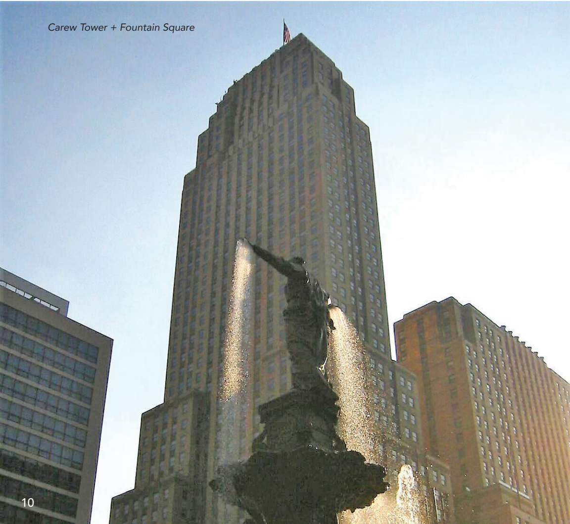
Carew Tower + Fountain Square

*Programs marked as AICP or AIA indicate sessions which are pending CM/CE approval.