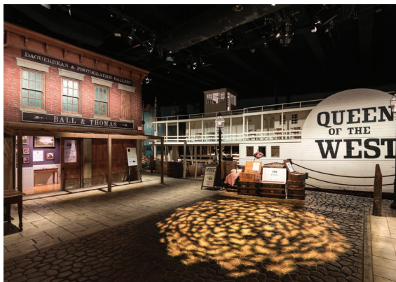
Cincinnati Museum Center