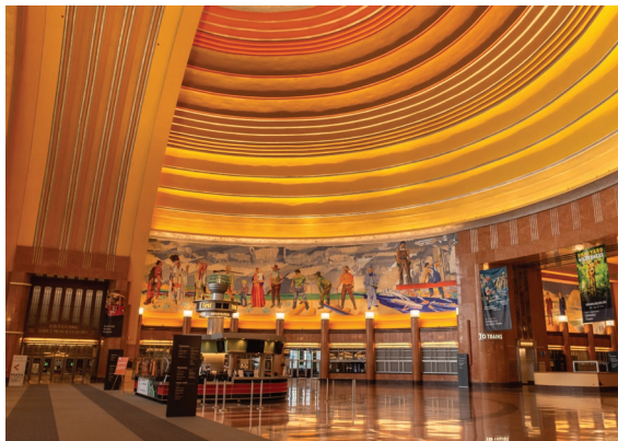
Cincinnati Museum Center, Union Terminal