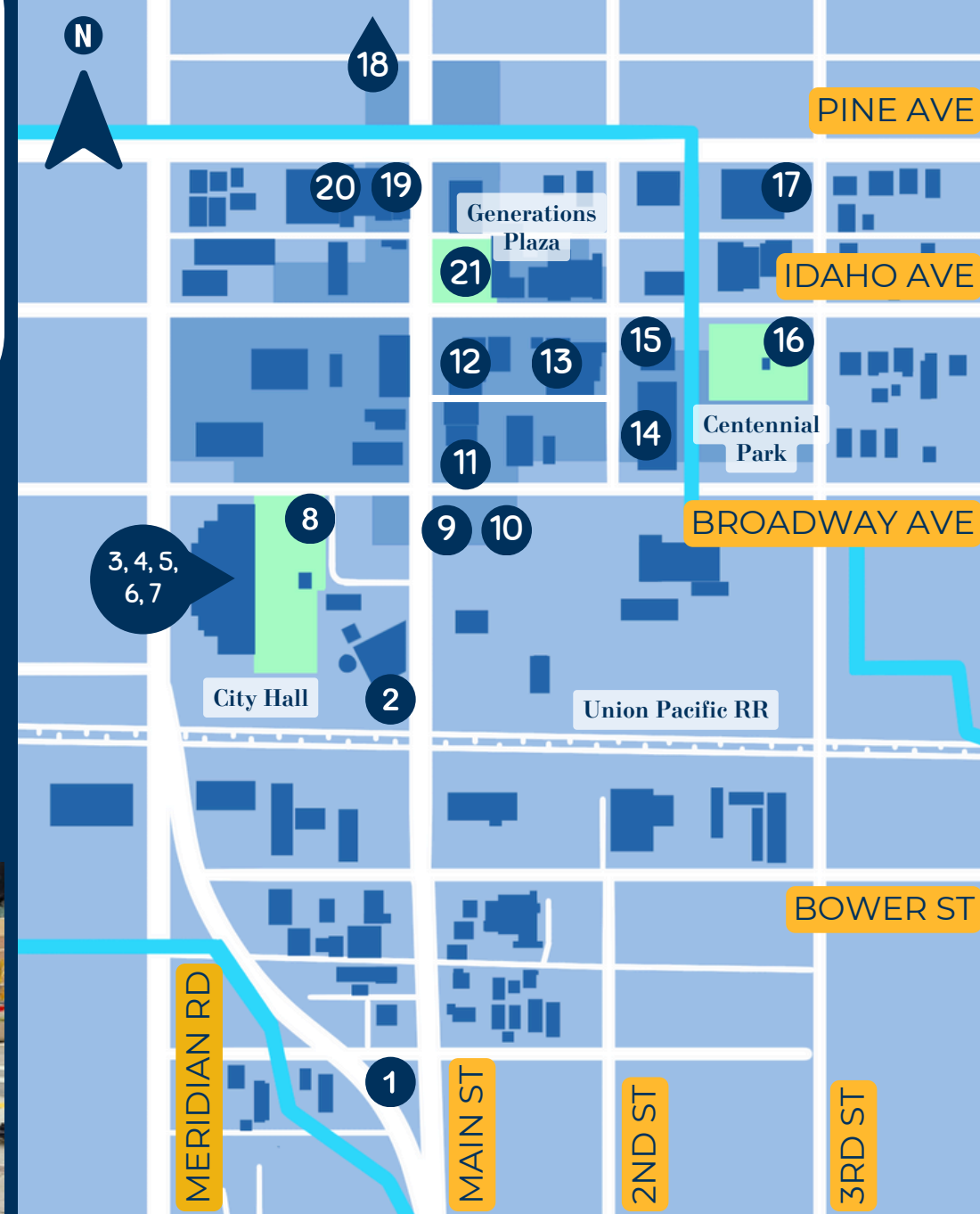
14 722 E 2nd St Title: Perfect Union Artist: Key Detail unBound is Meridian's unique small business and technology library and it displays this mural with imagery featuring a robot reading a book and a woman creating something on a digital tablet. The book and the tablet are united through a design in the background that mimics flipping the pages of a book, and in the top corners are images of the Idaho state bluebird, and a 3D printing of a bluebird. The artist said, "the concept is to show that old traditional ideas can be found with new conceptions in a perfect union." Year Installed: 2022