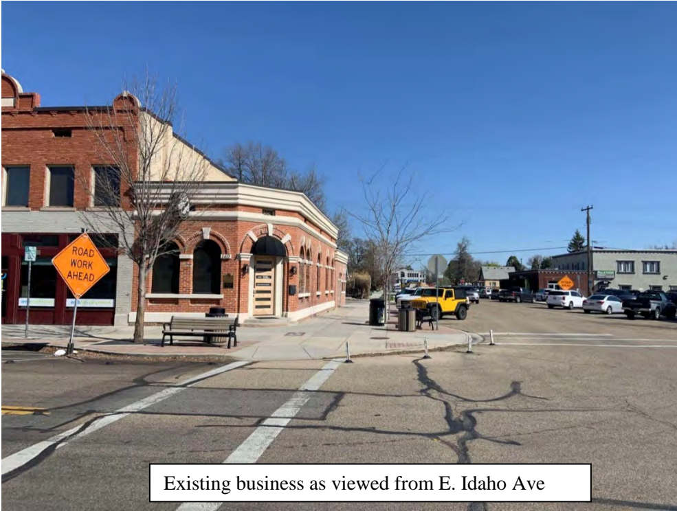
Existing business as viewed from E. Idaho Ave