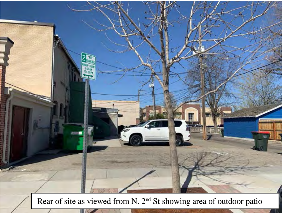
Rear of site as viewed from N. 2 nd St showing area of outdoor patio