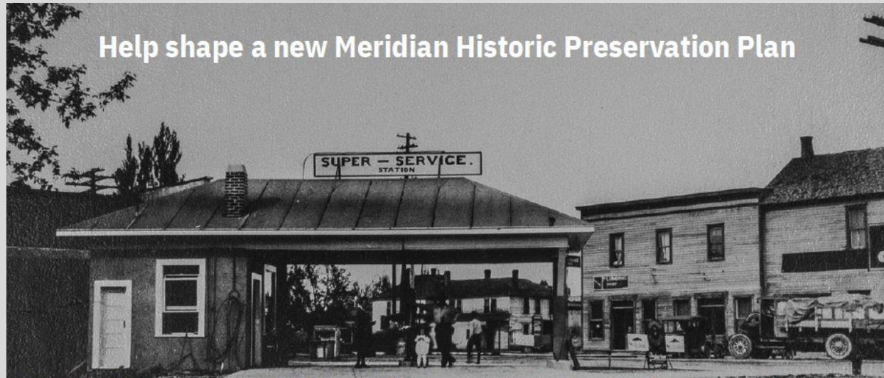
Photo: Broadway & E. 1st (Service Station) and E. 1st & Idaho (Hotel); circa 1920

Total Respondents: 114 (91 respondents from Meridian)