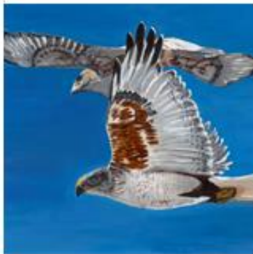
Cindi Walton Into the Blue