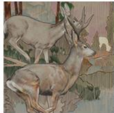
Lupe Galvan Deer at Dusk

The images shown here are cropped. To see the full image, please contact 489-0399 or mac@meridiandty.org | 6/15/2021