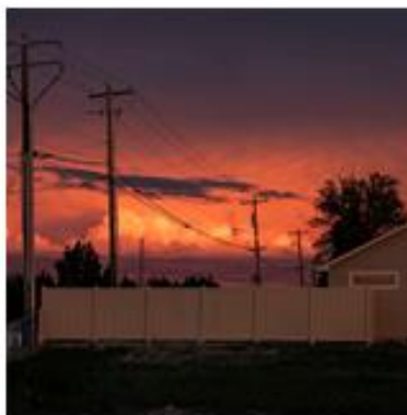
Tran Tran Drama Sky

The images shown here are cropped. To see the full image, please contact 489-0399 or mac@meridiancity.org | 6/15/2021