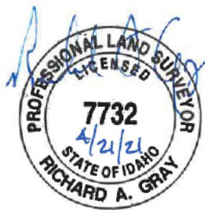
EXHIBIT 'B' ATTACHED HERETO AND BY THIS REFERENCE MADE A PART HEREOF.