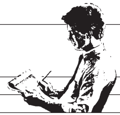
Exhibit design • Graphic design • Illustration

1321 Denver Avenue • Boise, Idaho 83706 • (208) 336-7627 • fritchman@msn.com