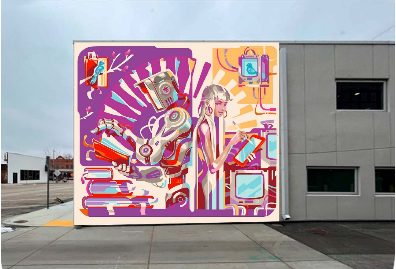
EXHIBIT B MURAL DESIGN CONCEPT